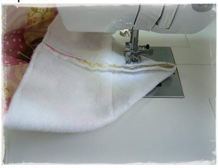
14) Trim excess.

13) Box corners. Sew the line: along the seam from the pointy end to the needle it is 1 3/4". Repeat this for the other corner too.