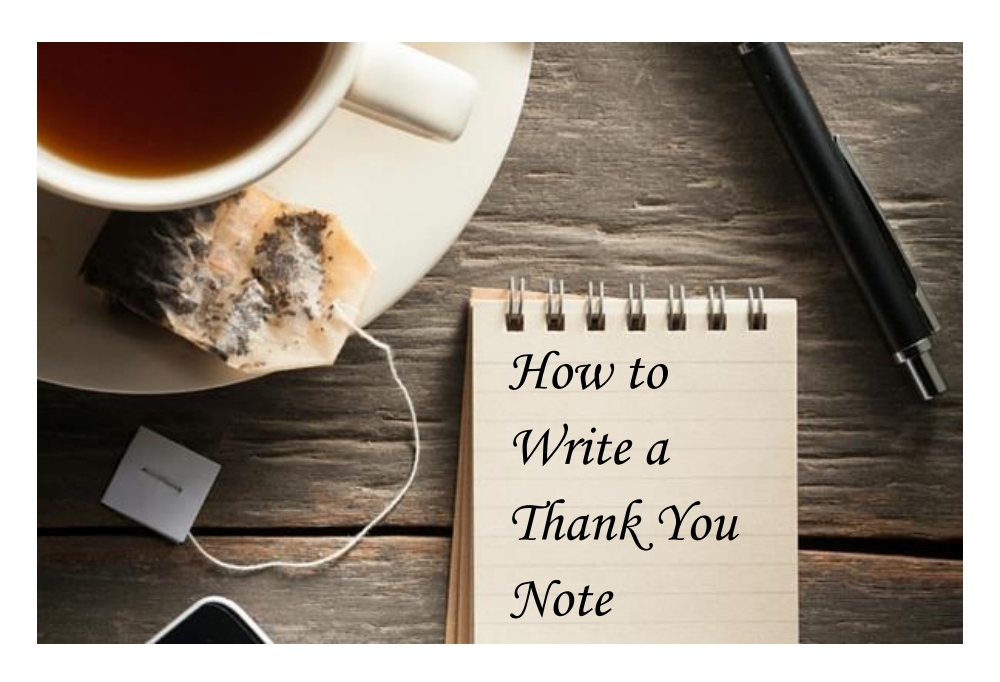
Click here to find out How to Write a Thank You Note!